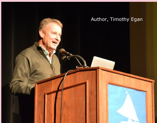
Author, Timothy Egan